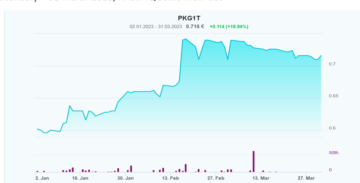
Trading price range and trading amounts of Pro Kapital Grupp shares, 1 January – 31 March 2023, NASDAQ Baltic Main List