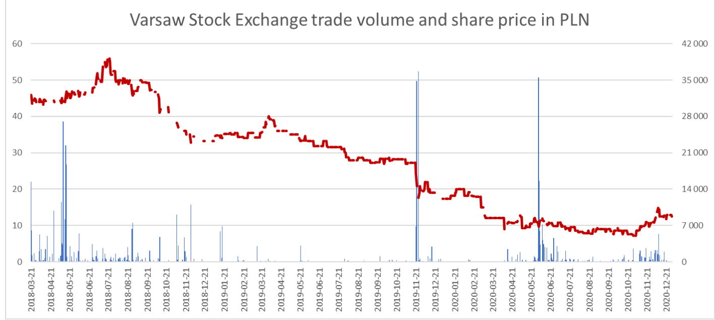
As at 31 December 2020, the Company's market capitalisation was PLN 96.81m.