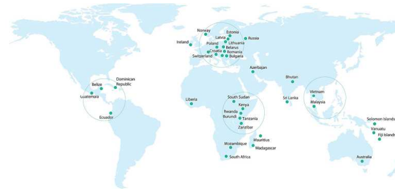
Scope of activity of companies managed by INVL Technology, AB

INVL Technology, AB later will apply to the Bank of Lithuania for closed-end investment company license and in its essence will become similar to investment fund.