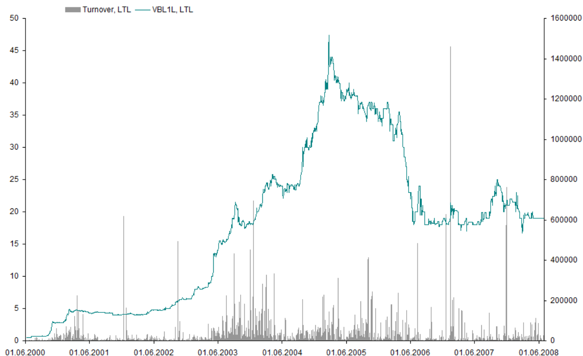
Fig. 6.1. Turnover and share price of Vilniaus baldai AB f (from the beginning of trading)