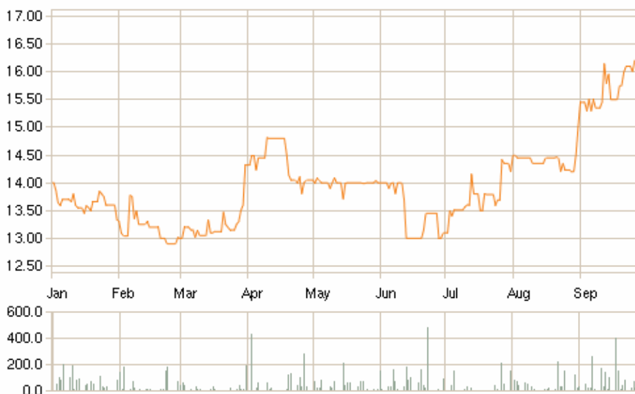
Picture 13.1 Trading in ORS of AB Sanitas in the VSE for the period 01 01 2006 – 29 09 2006